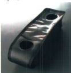
Protective cover (L6B, L8B, L10)