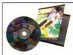
• CD Software & USB Cable