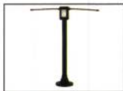
• Passive Antenna