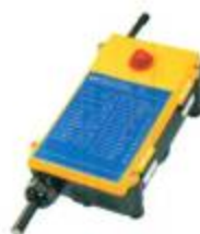
SAGA1-K1/K2 Transmitter SAGA1-K1/2 Receiver SAGA1-K3/K4 Transmitter SAGA1-K3/K4 Receiver