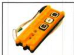
• SAGA1-K Copier