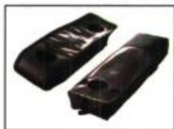
• SAGA1-K Protective Cover