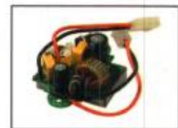
• 12-24V DC /DC Converter