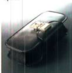
Protective cover (L4, 6, 8)