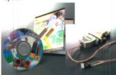
CD ROM + Cable